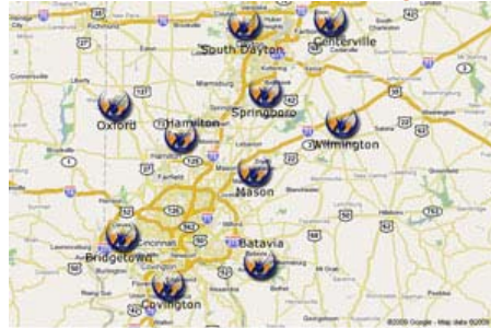
Mason | Hamilton | Batavia | West Side | NKY